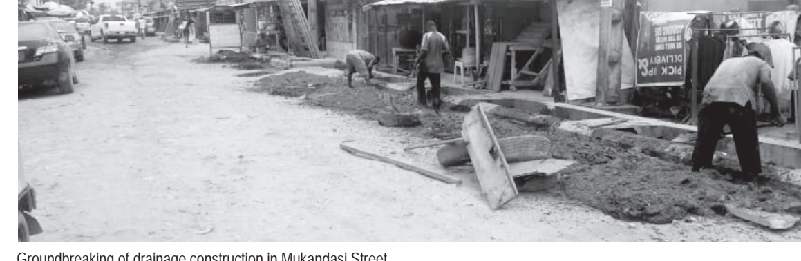
Groundbreaking of drainage construction in Mukandasi Street

The project, a one-sided 750/750 Open Drainage of 163 meter long will, upon completion, "improve our living condition because whenever it rains most houses here are always flooded but I'm sure with this standard drainage, we will be free from flood. I came here in the year 2000 and when I was the Residents' Association Chairman, I tried all I could to get government's intervention of this kind to the street but no effort was forthcoming from the government. I'm so much happy right now and I appreciate our