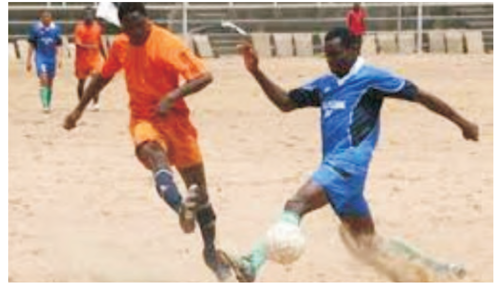
Golden Star Vs Flying Star

Flying Star were dealt another blow in the 39th minute through Nnamdi Ambrose of Golden Stars.