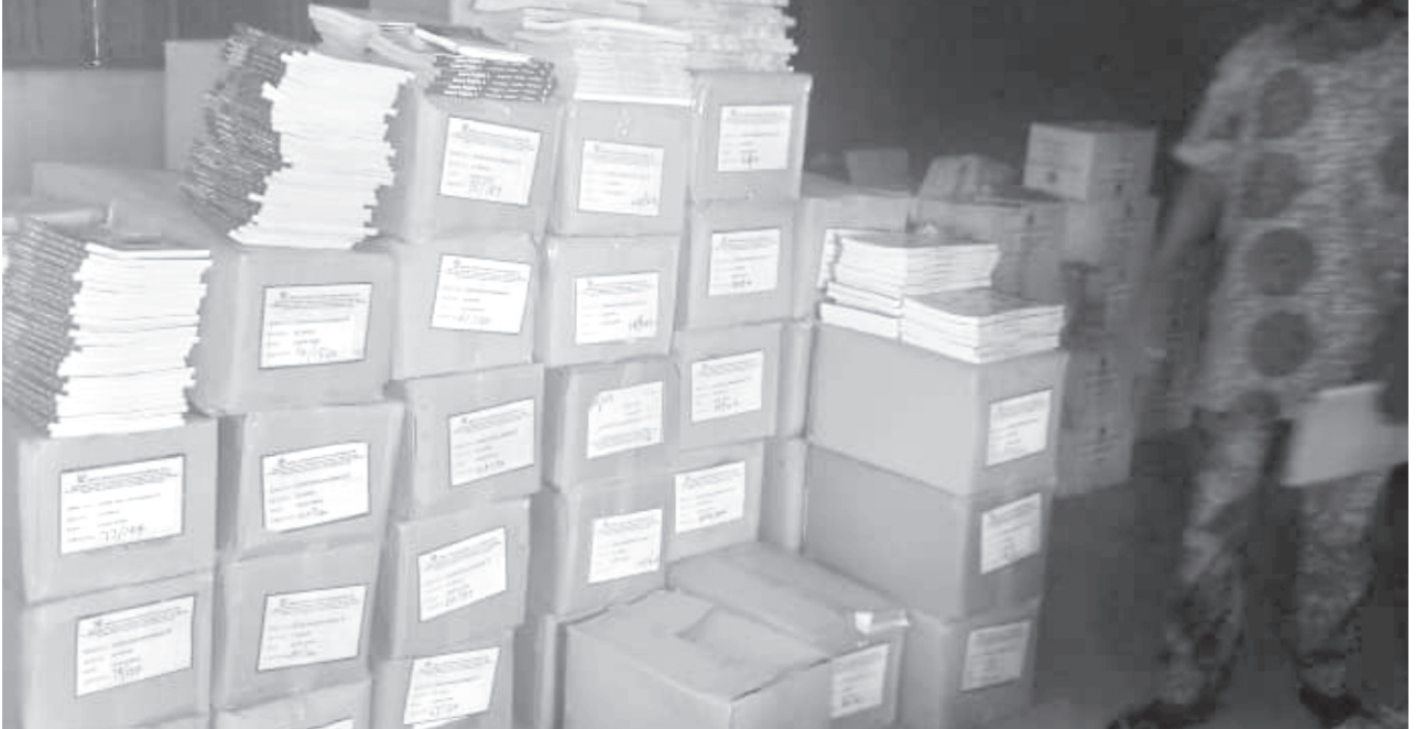
The intervention text books to ECCDE and primary pupils